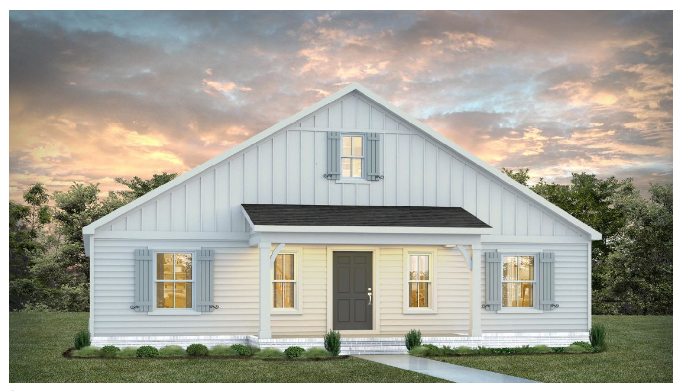
$230,384.60 Kraft Plan | 3 BR | 2.0 BA | 1775.0 Sq. Feet | 63.00 Depth | 35.96 Width

AVAILABLE IN TWO UNIQUE EXTERIOR ELEVATIONS – CLASSIC COUNTRY or CHIC CRAFTSMAN! The Amberly is a fantastic single-story home design with 3 bedrooms and 2 bathrooms. Upon entering this home, you will be greeted by an open floor plan, with the vaulted great room open to the breakfast room and oversized kitchen. The kitchen features an oversized seating island, as well as an abundance of cabinet and countertop space. There is also a full-size window in the kitchen for views of the surrounding scenery while cooking, eating, or anything in between. A rear foyer with access to the back porch and a large laundry room is located off the kitchen. The master suite features two walk-in closets, and a master bath with a tile walk-in shower and dual vanities. The interior of this ideal floor plan is completed by two more bedrooms, both of which are generously sized, and a shared bath. Please contact us today for more information.