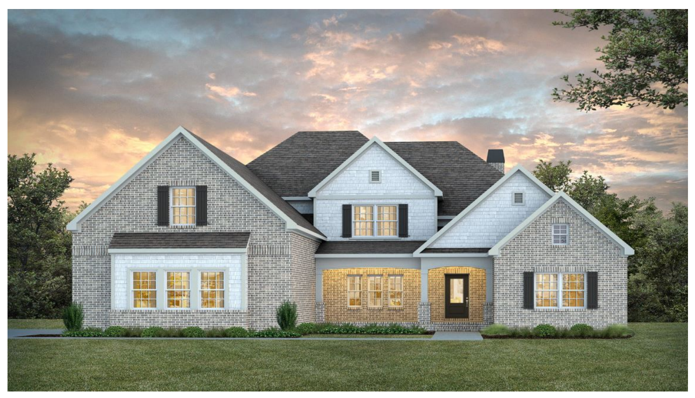
$484,242.63 Legacy Plan | 5 BR | 4.0 BA | 3745.5 Sq. Feet | 73.42 Depth | 62.83 Width

SPLIT BEDROOMS PLUS A BONUS SUITE! The Maxwell comes in two designs, with either brick or siding, boasting 5 bedrooms, 4 bathrooms, and over 3,700 square feet. Inside, discover a warm foyer, a dining room with a coffered ceiling, and a spacious open living area that includes a vaulted great room, kitchen, and breakfast room. The kitchen has a layout that includes an oversized sink and seating island, walk-in pantry, and an abundance of cabinet and counter space. The Maxwell's two dining areas include a breakfast room and a separate dining room. The master suite has excellent natural light and an oasis master bath with freestanding tub, tile walk-in shower, dual vanities, and separate toilet closet, and the master walk-in closet connects to the laundry room. Three bedrooms and two full bathrooms occupy the opposite side of the home, and upstairs there is a massive bonus suite with a bedroom and full bath. The Maxwell can be tailored in many ways. Call today to learn more!